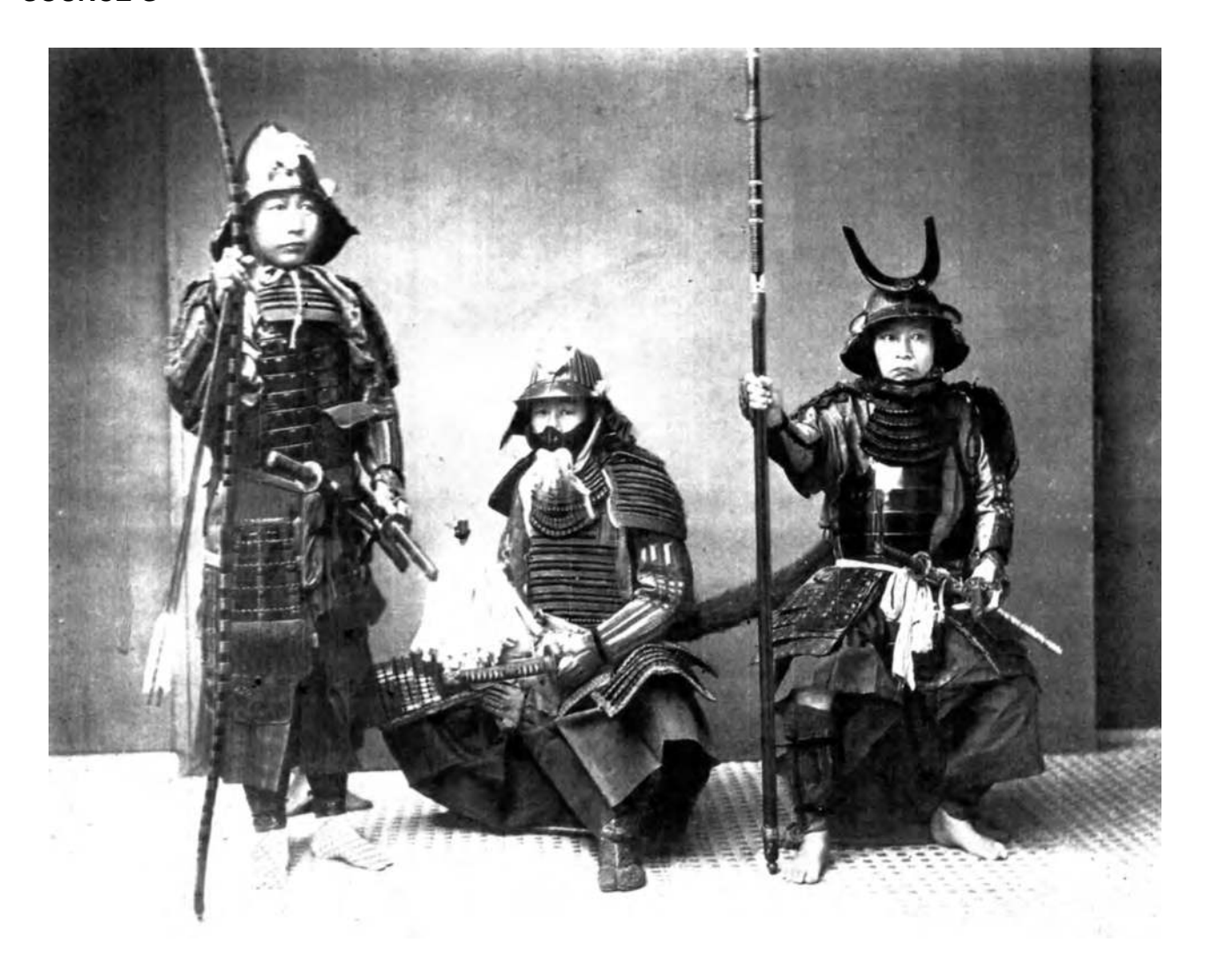
A photograph of Samurai in the 1890s.